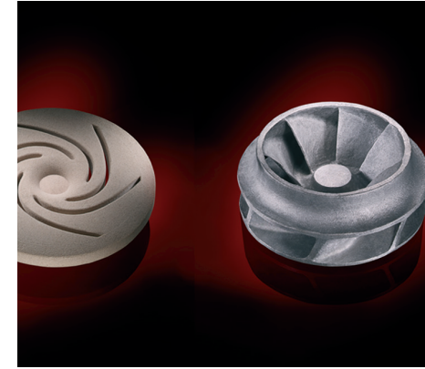
Determination of core hardness

A range of cold set binders designed to give high strengths, high productivity and minimal odour levels on mixing and low smoke evolution on casting. A three component phenolic binder process giving a range of set times between 2 and 30 minutes. Excellent hot strength properties are achieved resulting in low erosion defects and excellent dimensional accuracy. High sand reclamation rates up to 90% can be achieved with dry attrition and even higher rates are possible with thermal techniques. Suitable for non ferrous, iron and steel foundry applications.